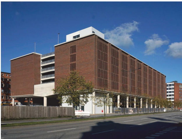
View from Kaistraße