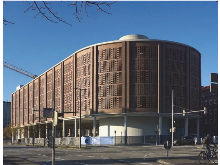
View from new Town Hall

The facade of the parking garage consists of a brick grid, which required approval in individual cases.