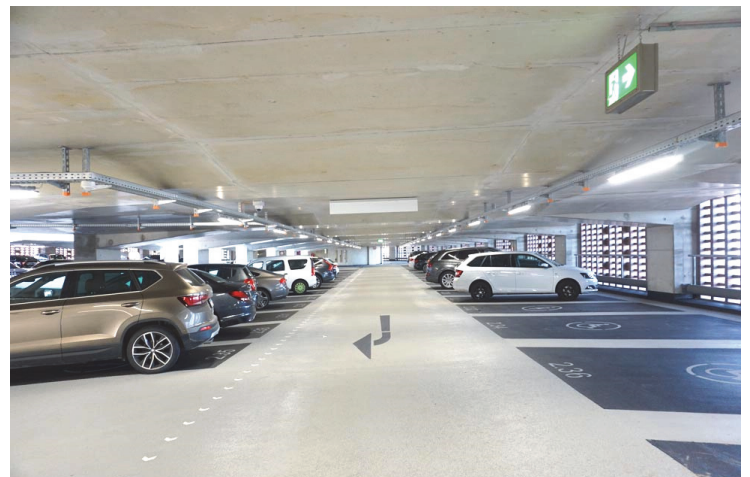
Internal view